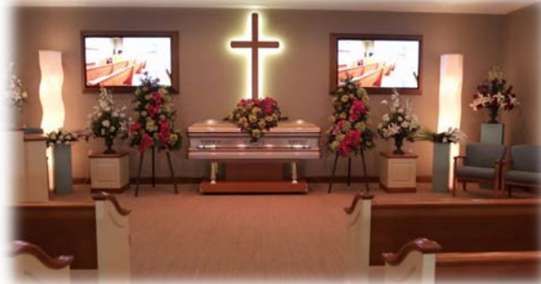
Other Optional Merchandise/Services: