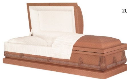
20 ga. Non-gasketed casket